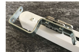
Central Butt Opening