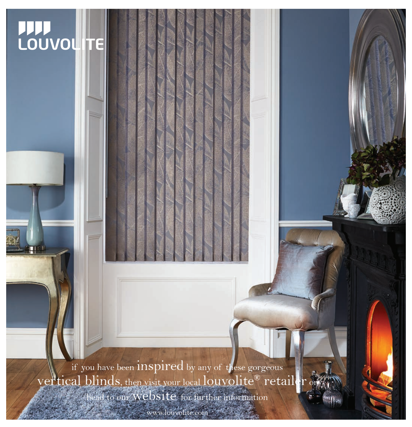
your local louvolite® accredited vertical blinds retailer...